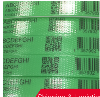
Shipping & Logistics