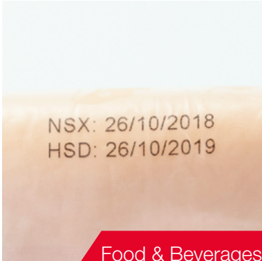
Food & Beverages